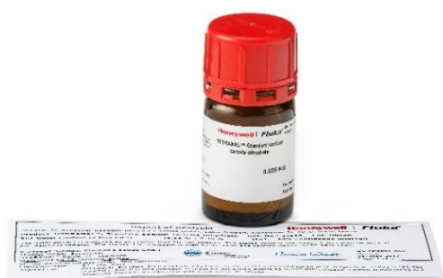
Fig. 2. Hydranal-Standard Sodium Tartrate Dihydrate.

Liquid standards, like Hydranal-Water Standard 10.0 (water content 10 mg/g = 1%), consist of a solvent mixture with specific composition and precisely determined water content. They are packaged in glass ampoules under argon. Each box contains ten single-use ampoules which are easy to open (pre-notched).