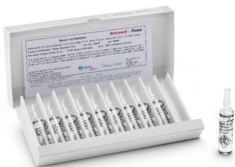
Fig. 1. Hydranal-Water Standard 10.0.

Liquid standards, like Hydranal-Water Standard 10.0 (water content 10 mg/g = 1%), consist of a solvent mixture with specific composition and precisely determined water content. They are packaged in glass ampoules under argon. Each box contains ten single-use ampoules which are easy to open (pre-notched).