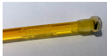
Fig. 2. Example of dosing tube contaminated with crystals.