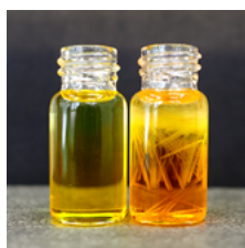
Day 2: Reagent M crystallization starts