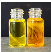
Day 14: Hydranal crystallization starts