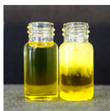
Day 3: Reagent M crystallization starts