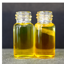
Day 1: Reagent M crystallization starts