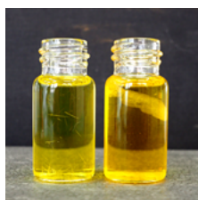
Day 14: Hydranal crystallization starts