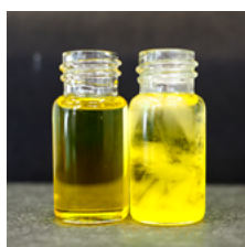
Day 5: Reagent M crystallization starts