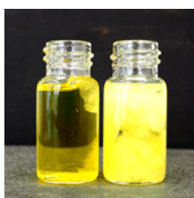
Day 14: Hydranal crystallization starts